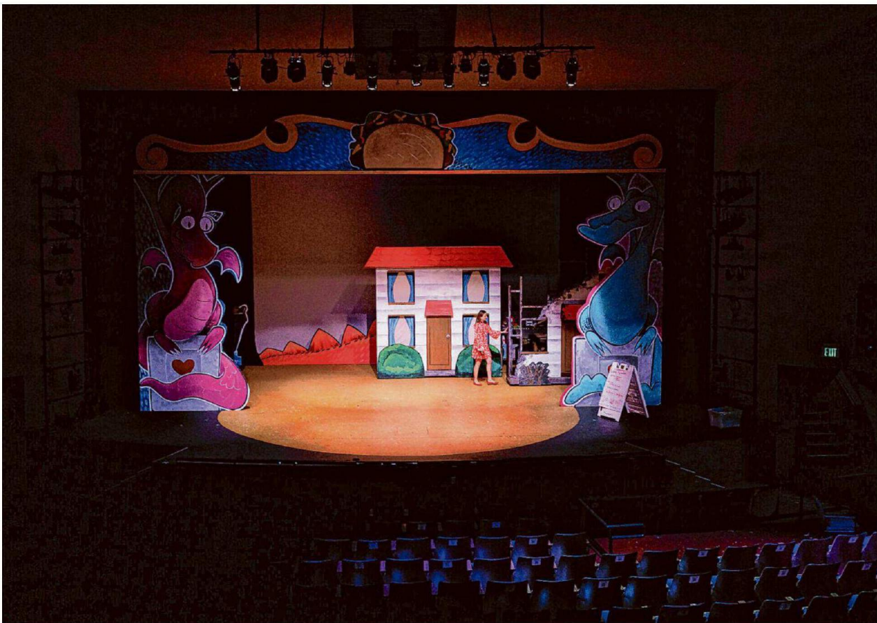
Magik Theatre’s summer production, “Dragons Love Tacos,” will go on tour in February while the company’s home at Beethoven Hall is temporarily closed for renovations.