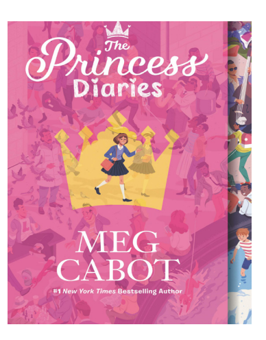
The Princess Diaries by Meg Cabot